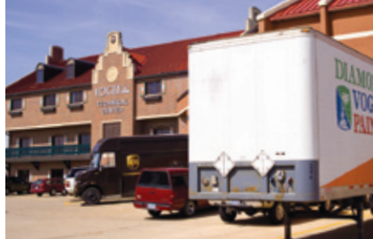
Paint manufacturer Diamond Vogel operates an industrial campus in Orange City.

Businesses in Orange City's industrial park employ nearly 1,500 people, says Gary Blythe, assistant city administrator. The city recently developed a second, 100-acre industrial park adjacent to the first one.