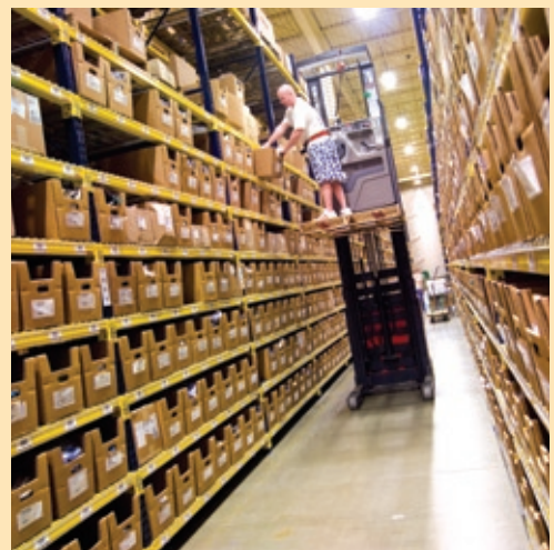
HIRING HIGH-QUALITY HELP: Staples Promotional Products benefits from Northwest Iowa’s well-educated, committed workforce.