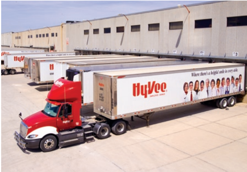
FEEDING THE NATION: Northwest Iowa's location in the center of the agricultural Midwest made it a natural choice for Hy-Vee's grocery distribution center (above). Wells Dairy (right), makers of Blue Bunny Ice Cream, operates two production facilities in Le Mars, where it was founded in 1925.