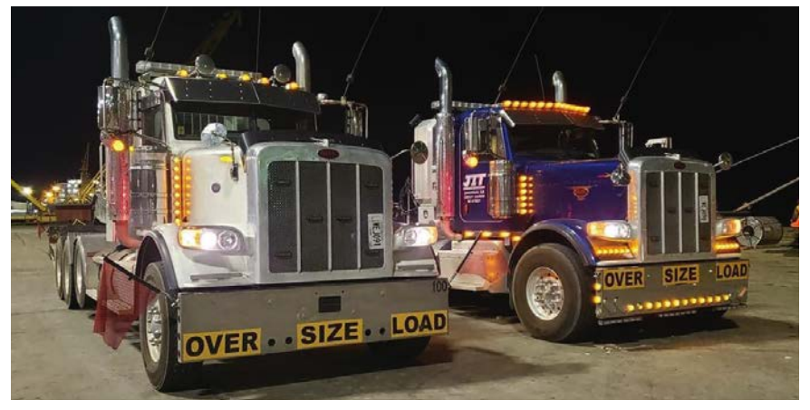
JIT Warehousing & Logistics, a Georgia family business, provides warehousing, trucking, shipside delivery, port pickup, container drayage, stripping, stuffing, cross-docking, and over dimensional/crane services, offering specialized trailers for heavy haul.

JIT — which stands for Just In Time provides warehousing, trucking, shipside delivery, port pickup, container drayage, stripping, stuffing, cross-docking, and over dimensional/crane services. The company's over-dimensional division includes local road escort, rigging, cargo transfer on and off flat racks, securement to line requirements, and additional specialized trailers for heavy haul.