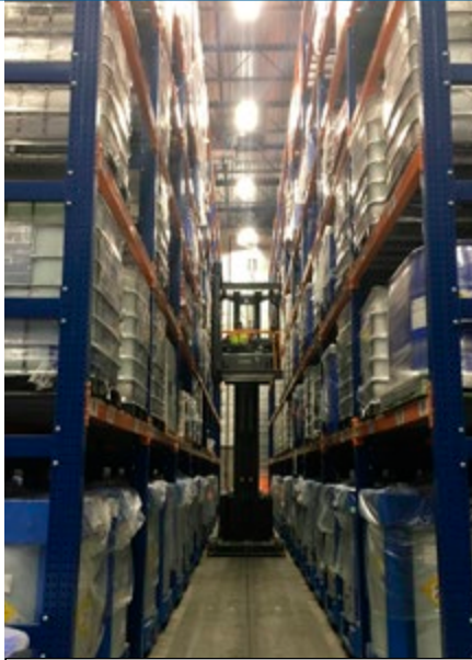
Rinchem's warehouses are designed for safe and efficient chemical storage and handling.

Along with striving for maximum safety, companies that ship chemicals—like most shippers—continuously look for ways to make their supply chains more efficient. One strategy that's especially important in the chemical industry, according