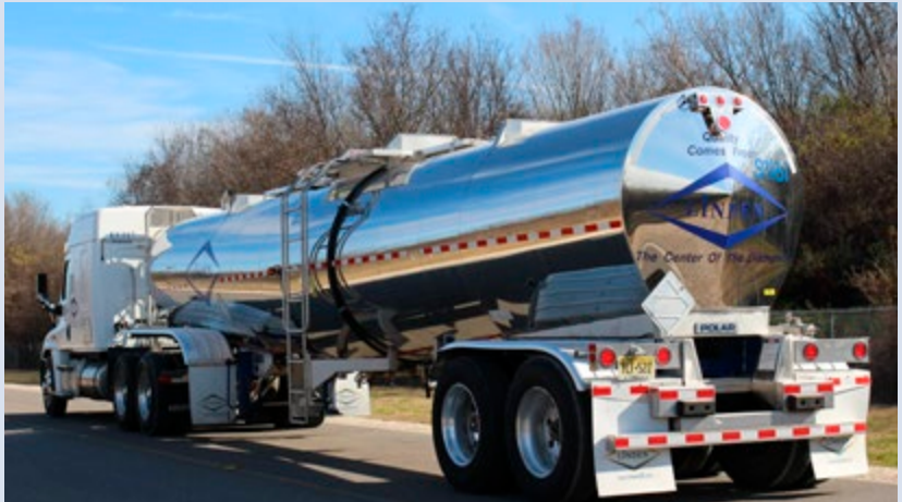
At Linden, all equipment and trailers undergo stringent inspections and mandatory vehicle condition reports to ensure they can deliver for customers.

In the packaging operation, Linden works closely with local bulk carriers to transfer chemicals from tank trucks or intermodal bulk containers into pails, drums, or totes. “We conduct the filling operation on computer-controlled filling lines with integrated calibrated scales, which ensures the drums, totes, and pails consistently reach the desired fill weight,” Stadlin says. Linden can also transfer liquids from drums or totes back into larger containers, tank