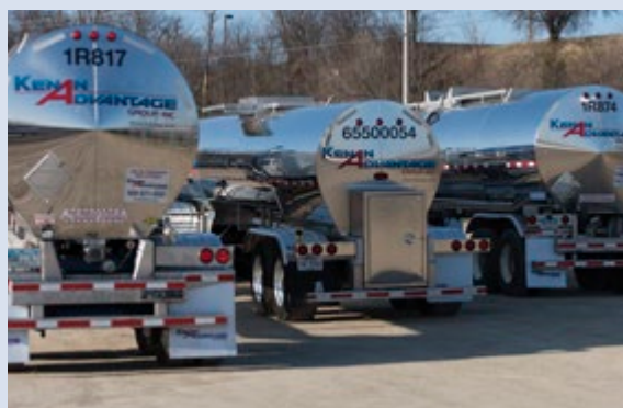
KAG applies strict safety and security measures to its chemical services, and offers guaranteed capacity to meet shippers' needs.

In the ongoing quest for greater efficiency in logistics, information technology is continually offering new capabilities. "One is to be able to anticipate and better provide predictability," Forbes says. "More and more, predictive analytics are becoming a component of decision making."