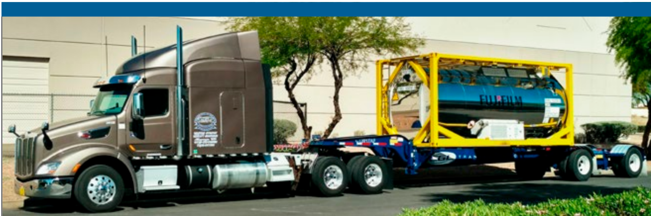
Asset-based 3PL Rinchem safely and efficiently transports millions of pounds of chemicals, as well as hazardous and non-hazardous materials each year.

and documentation. “We provide that service globally, but there was really a need in our Asia market,” he says. “We had started a couple of years ago in Shanghai, and we recently expanded the service.”