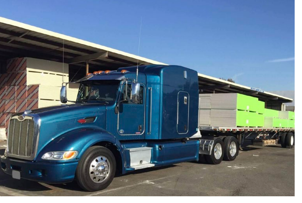
By implementing Transplace's proprietary TMS, building products manufacturer USG Corporation optimized its transportation network, and can now view shipments in real time and reduce freight costs.

Like Pro-Con, a growing number of mid-sized and even small companies can leverage transportation management systems that previously were out of reach for all but the largest enterprises.