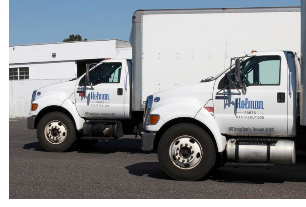
Holman Parts Distribution leverages Kuebix's cloud-based TMS to gain control of freight spend, obtain the best price at the best value from carriers, and track all shipments from a single site.

Moreover, the algorithm should calculate on the fly. Say a shipper is ready to move five LTL shipments, each a different product, from Atlanta to New York. Then a customer requests