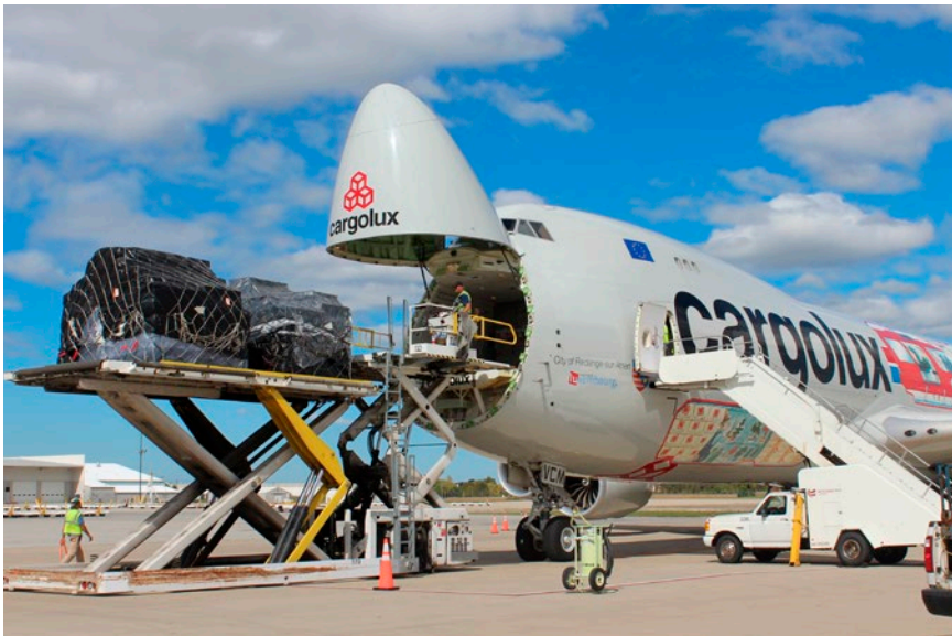
One of the world's only cargo-dedicated airports, Rickenbacker International Airport in Columbus, Ohio, handles cross-border shipments to and from Canada daily.