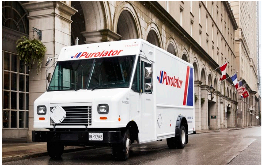
Logistics provider Purolator guarantees delivery of e-commerce shipments to the Canadian market generally within 2-4 days, making U.S. e-commerce sellers competitive with their Canadian counterparts.

relations with China, and the potential recalibration of supply chains away from China.