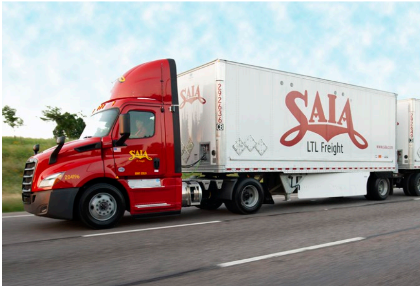
Saia's extended service beyond its 48-state direct coverage area encompasses hassle-free shipping to and from Canada. With 11 interchange locations, freight is handled less, which reduces claims and speeds transit times.

realm, too, he says, cooperation between the two governments is essential. “We work very closely with Canadian and U.S. customs to be sure there is no contraband in shipments. We help our clients protect their supply chains.”