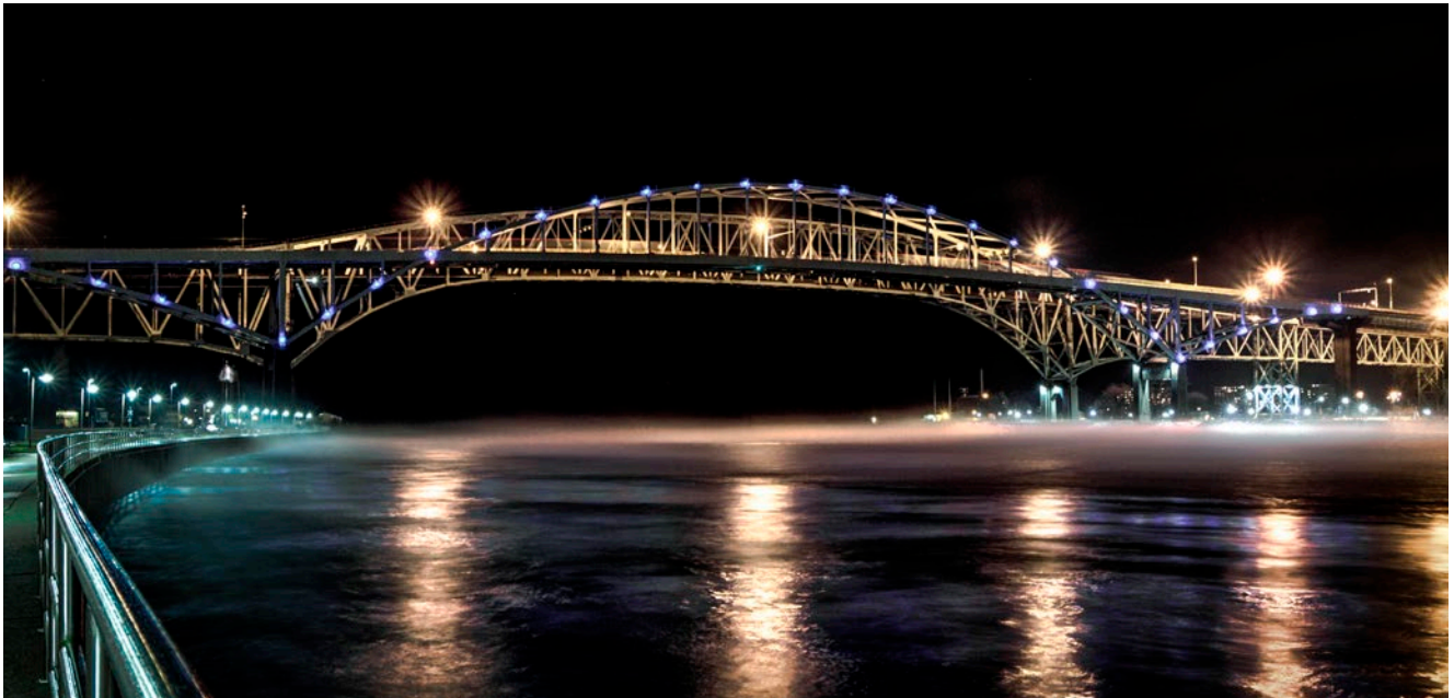
Successfully shipping across the U.S.-Canada border, including the International Blue Water Bridge, which connects Port Huron, Michigan, and Sarnia, Ontario, Canada, involves diligent documentation and using a reliable service provider to expedite the process.

56% regularly participate in retail loyalty programs,” he says.