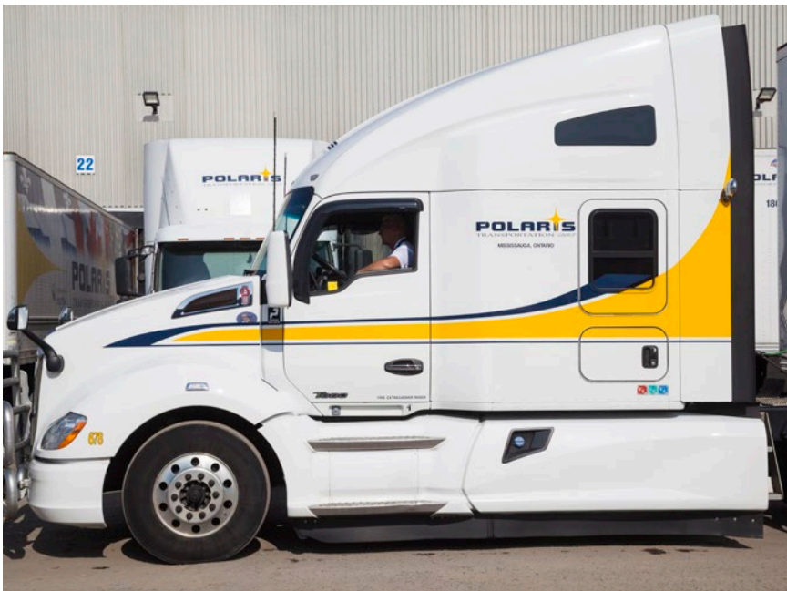
U.S. shippers trust Polaris Transportation Group to move their LTL freight to Canada. The company's expertise assists with security, customs clearance, and documentation.

To that end, clients are put through a security audit and shipments are examined with X-ray equipment. In this